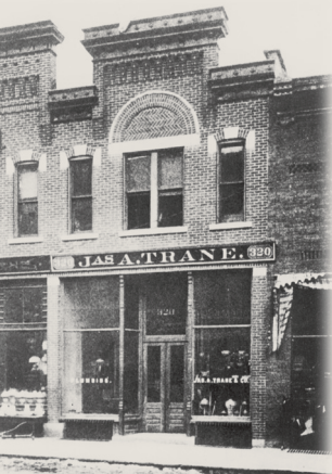
Trane Storefront La Crosse, Wisconsin 1891

Trane has a tradition of quality lasting more than a century.